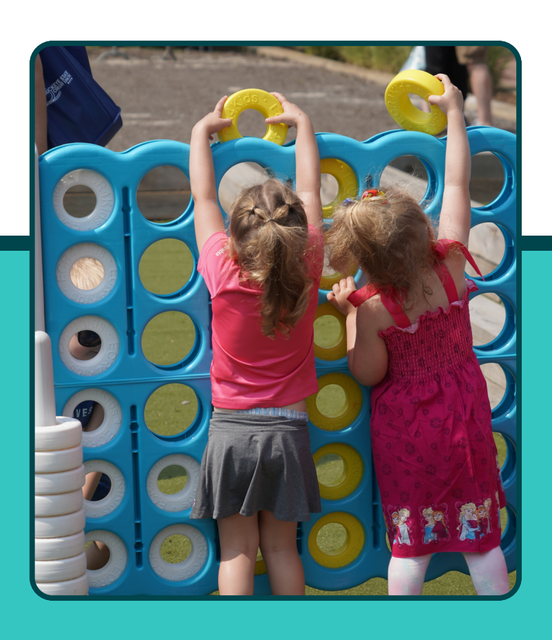
Family Game Zone