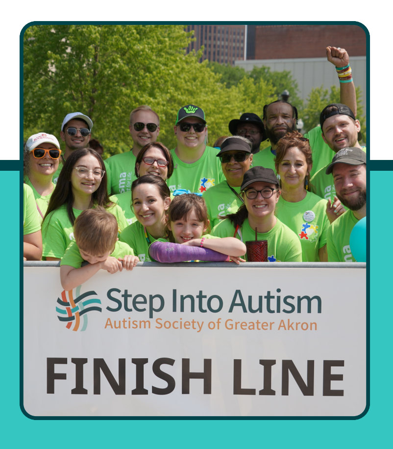
Team & Sponsor Photos