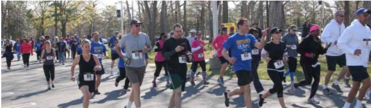
2013 CCC Alumni 5K Run Start