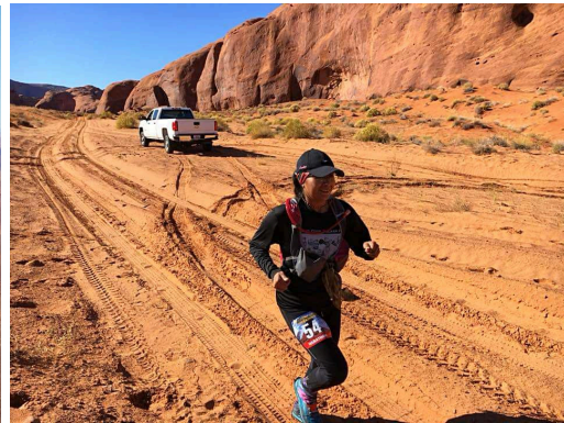
Running on the Arches Loop

COURSE – The routes of all races are very scenic and challenging. Please study the course map and “MV Ultra Course Guide” to get a feel for the course. It is important that you know the routes prior to the race and develop your energy and hydration plan.