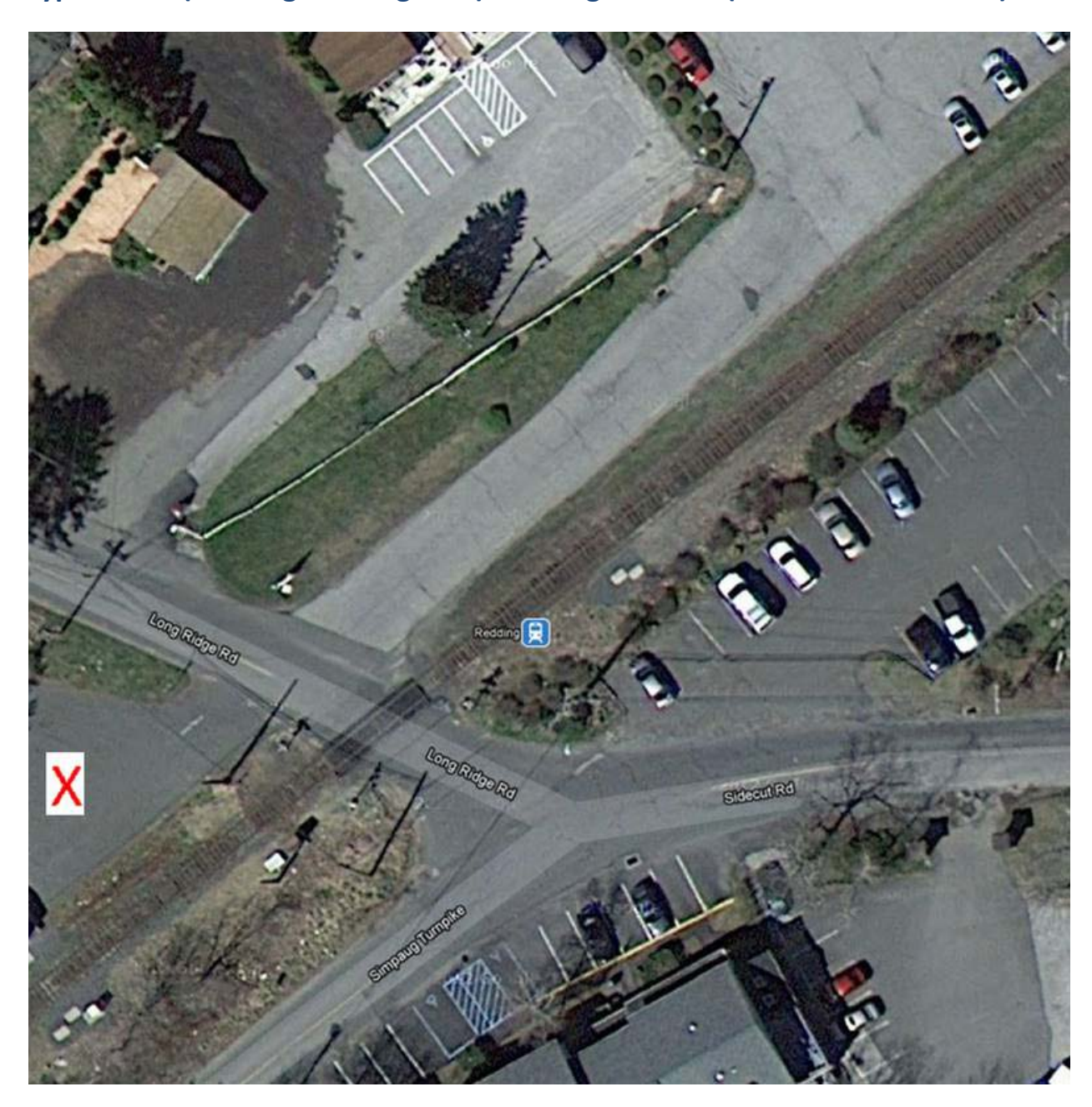
Typical RRC (Redding Running Club) Meeting Location (Mile 1.5 of the races)