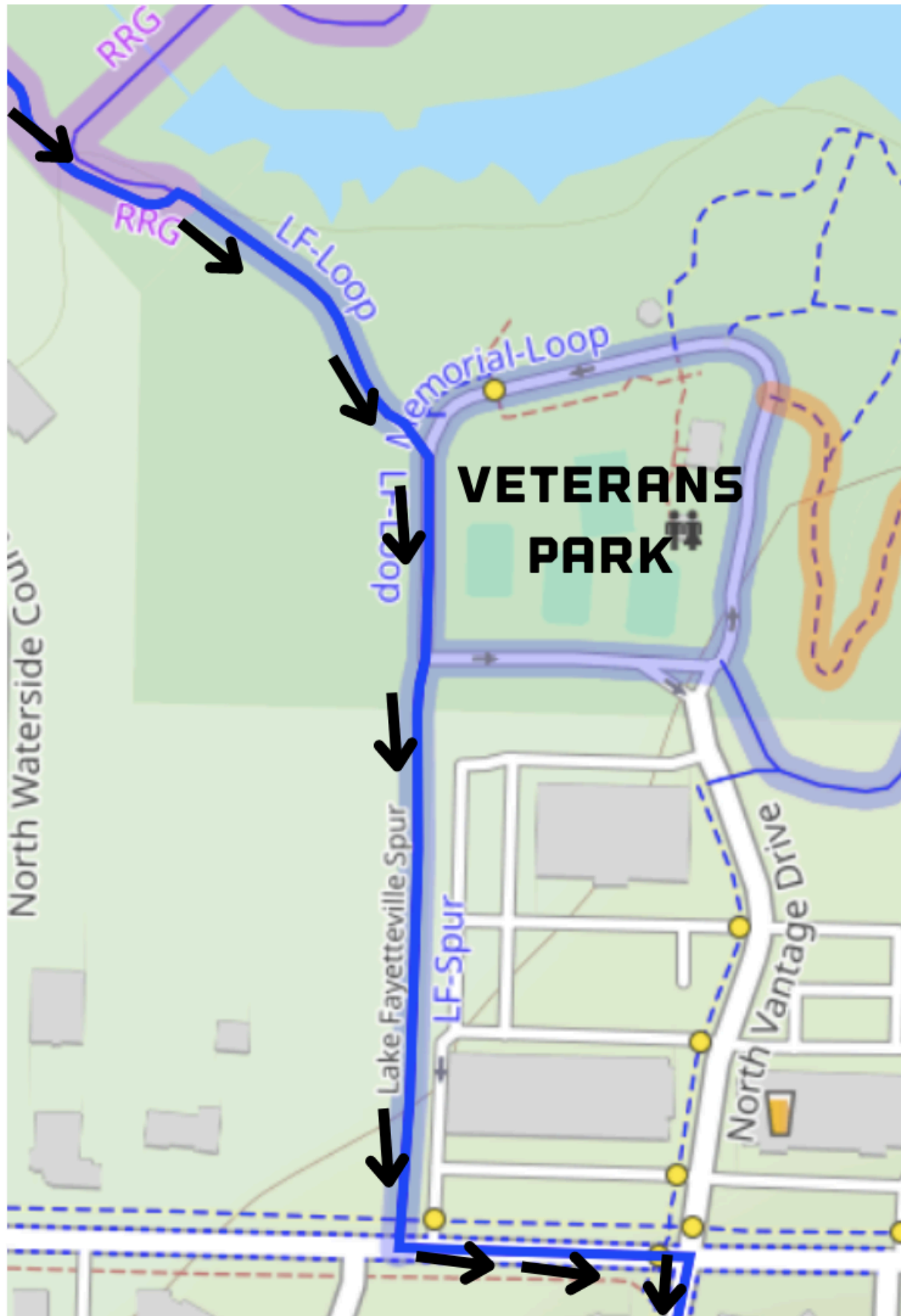
Quarter Marathon Lokomotion Hill to Zion Rd