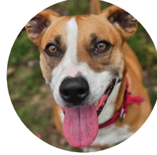
Lupita Dog Sensitive

Join us for our 4th annual Run For Their Lives to support homeless animals.