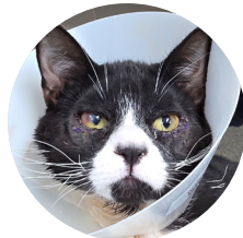
Herbie Eyelid Condition