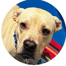
Peanut Butter Rear Leg Amputation