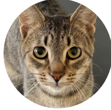
Pancake Ear Polyp