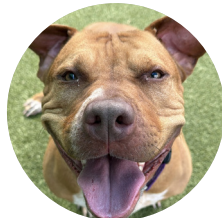
Sarabel Spinal Disease