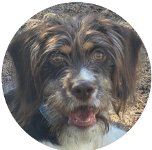
Mooka Heart Murmur

Join us for our 4th annual Run For Their Lives to support homeless animals.