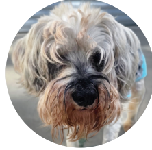
Waffles Heart Murmur, Cataracts