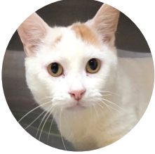
Guarapo Scabies, Knee Issues