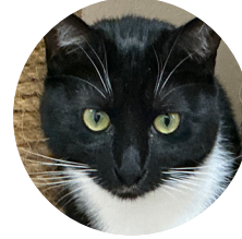
Poppy Socially Challenged