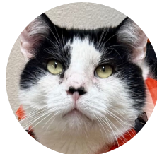
Panda Long-term Resident