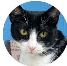
Roo Over Stimulated