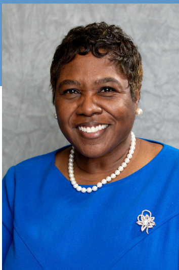
Yolanda Small Fundraising Committee