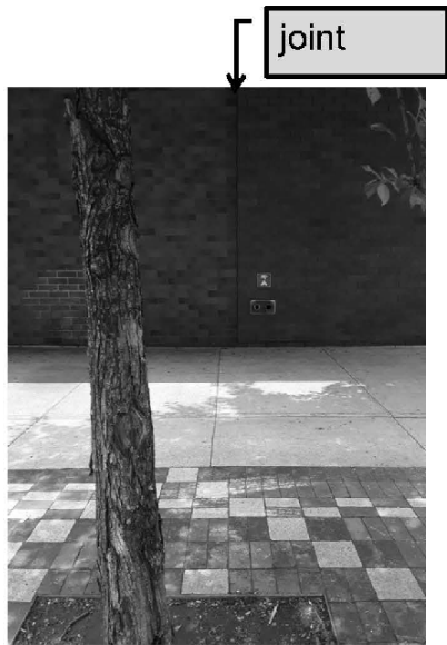
Photo of vertical joint in wall of the Atrium building on the west side of S. Salina St. The Start/Finish is aligned with this joint.