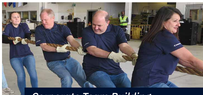
Corporate Team Building