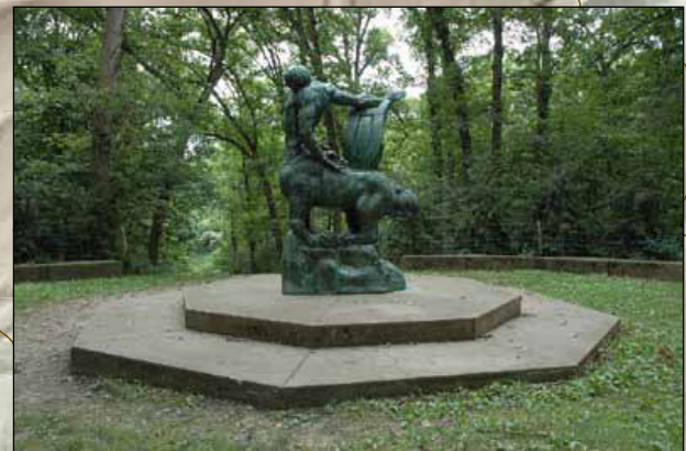
Death of the Last Centaur