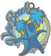
Half Marathon & 2 Miler Finisher Medals