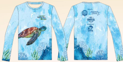
Half Marathon & 2 Mile Shirt